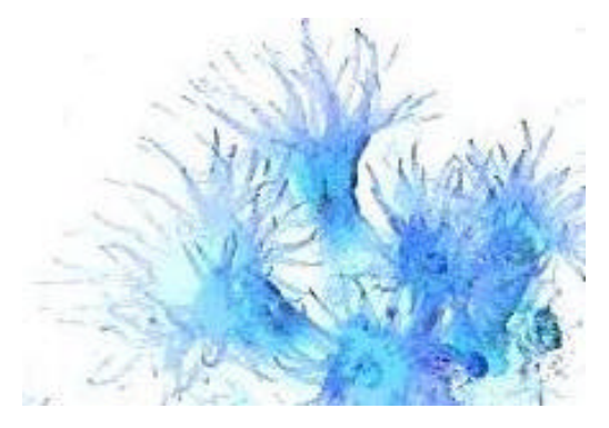
Coral, Dendrophyta sp.

In December they surveyed a number of areas including the reefs around the islands of Musha and Maskali, two sites off-shore from Maskali, Khor Ambado, Les Trois Plages, Sable Blanc, Ras Duan, Sept Frères, Recif d'Ambouli (near the Djibouti port), and one site off-shore from Tadjourah. This survey will complement the PERSGA/ALECSO survey carried out in April 1998.