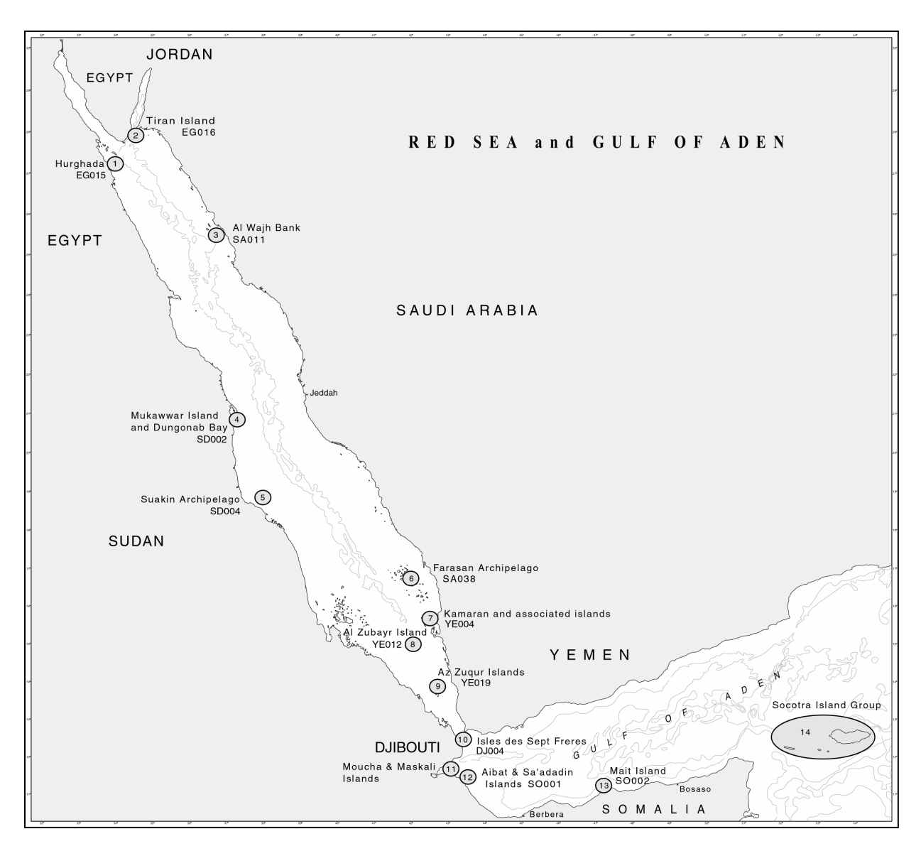
Figure 2. Priority sites for the conservation of nesting seabirds in the Red Sea and Gulf of Aden (from PERSGA/GEF 2003a)

Several important measures to minimise the impact to coastal species and ecosystems from oil spills have already been implemented, including the development of national oil spill contingency plans by Egypt, Jordan, Saudi Arabia and Sudan, the oil spill equipment stockpile in Djibouti and progress towards the establishment of the Marine Emergency Mutual Aid Centre (MEMAC) in Egypt. PERSGA has also been promoting a number of measures to reduce navigation risks and maritime pollution through Component 2 of the SAP. It is vital that further actions are taken where necessary to ensure that all measures are fully implemented and effective in the long term.